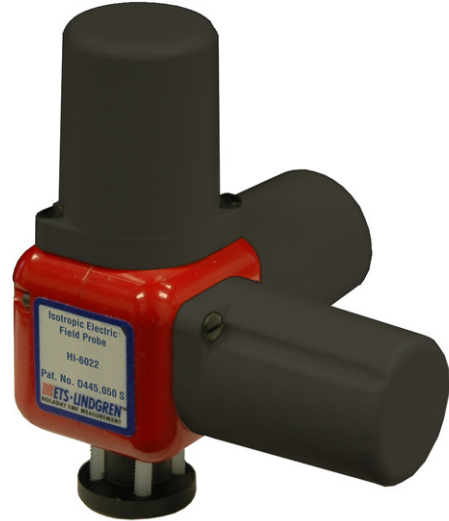
ETS-Lindgren's Model HI-6122 EMF Field Probe

ETS-Lindgren's HI-6122 EMF Field Probe provides broadband EMF frequency coverage and wide dynamic range that satisfies the demands of most test requirements. To take advantage of this capability, the HI-6122 was designed to be single range reading so data can be read continuously over the entire dynamic range. Data values for each axis (X, Y, Z) can be read individually or summed.