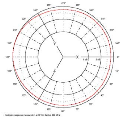
Model HI-6122 Typical Isotropic Response